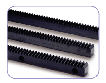
Metal Nylon Rack