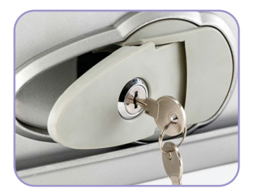
Manually Release Clutch