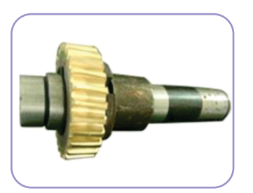
Inside Design Copper Material